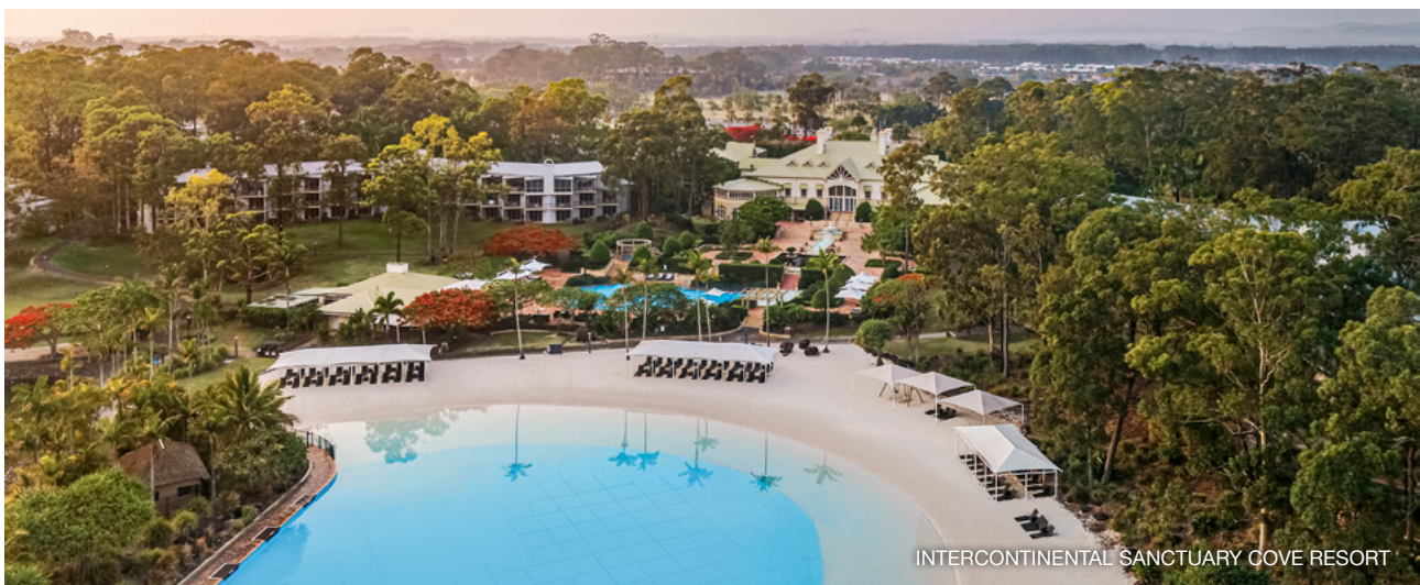
INTERCONTINENTAL SANCTUARY COVE RESORT

As well as the chance to totally immerse ourselves in the latest innovations and look over the horizon, this is an exceptional opportunity to make meaningful new connections as well as renewing friendships in an atmosphere which fosters free and open discussion around a joint commitment to positively impacting on our future.